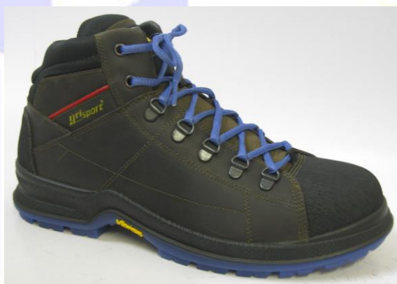
Sole design (black version)